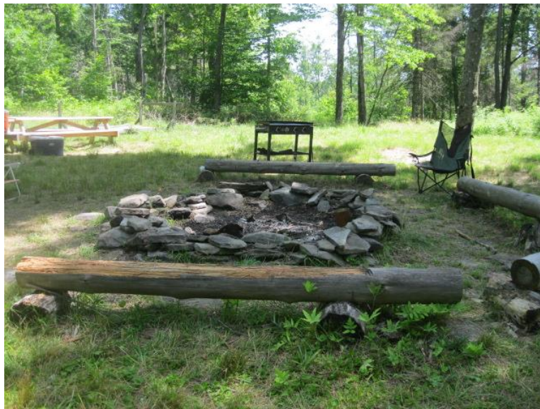
The fire ring