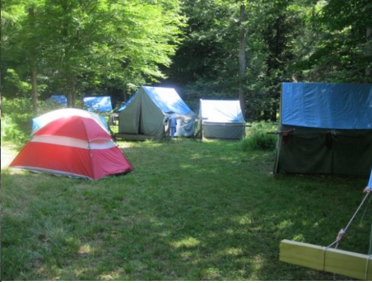
South end of campsite