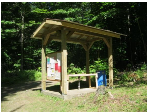
New washstand (2016) w/bulletin board

Mohican has transformed dramatically over the years. This site is the closest to the Shooting Sports program area and the Shower Building. In 2016 a new washstand was built to replace the original which fell victim to a fallen tree. Several troops have made some wonderful improvements to the site as well. The site is all grass and is kept immaculate! An access trail has been marked out to provide a link to Tuscarora's 15-mile trail system. There is a lot of foot traffic as Scouts and Staff travel to/from the ranges.