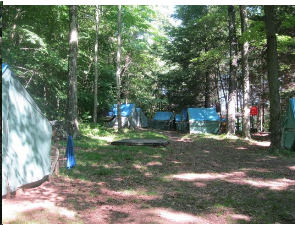
General site picture