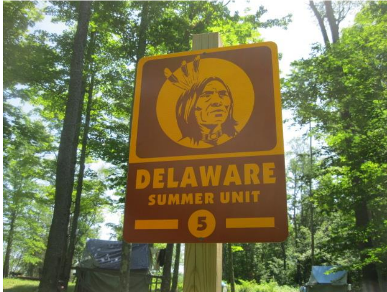
Road to Paradise - Delaware

Delaware is a large campsite! Typically it is set up for 30 campers; however more tents/platforms can be added as needed. Be advised, as this site can/will accommodate two smaller troops if necessary. There is a latrine, washstand, picnic tables, and a large fire ring. This site is located just south of "Summit Rock" which is the highest point on the Reservation at 1980 feet. While the site is all grass; the ground is very un-even so it is difficult to keep the grass as short as we'd like. It's all part of Delaware experience! There is road access, but it is a very rough road. Only vehicles with 4WD/AWD and high clearance should make the journey up. We hope to have a new, more vehicle friendly road, built in the near future. The Ranger Crew will gladly move your troops gear (and trailer if necessary) to the site. On a hot summer day; this is the place to be, aside from the waterfront of course! Several years ago we did a lumber harvest up here on the ridge which opened up a lot of the area. Great place to view the night sky, and to enjoy peace and quiet!