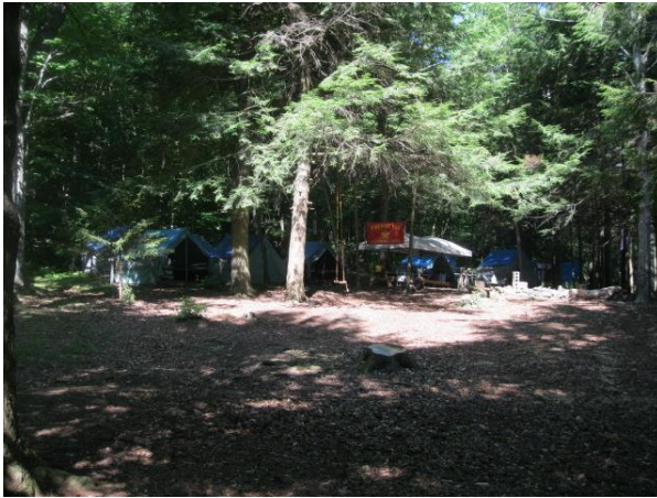
General site picture