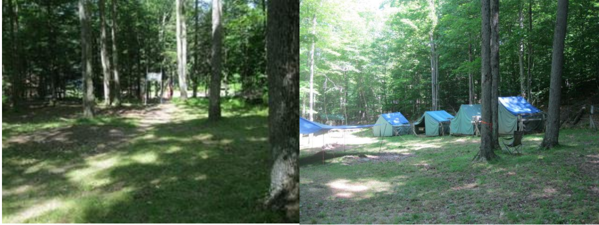
Looking down towards the Dining Hall