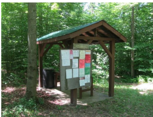
Washstand w/bulletin board

Delaware is a large campsite! Typically it is set up for 30 campers; however more tents/platforms can be added as needed. Be advised, as this site can/will accommodate two smaller troops if necessary. There is a latrine, washstand, picnic tables, and a large fire ring. This site is located just south of "Summit Rock" which is the highest point on the Reservation at 1980 feet. While the site is all grass; the ground is very un-even so it is difficult to keep the grass as short as we'd like. It's all part of Delaware experience! There is road access, but it is a very rough road. Only vehicles with 4WD/AWD and high clearance should make the journey up. We hope to have a new, more vehicle friendly road, built in the near future. The Ranger Crew will gladly move your troops gear (and trailer if necessary) to the site. On a hot summer day; this is the place to be, aside from the waterfront of course! Several years ago we did a lumber harvest up here on the ridge which opened up a lot of the area. Great place to view the night sky, and to enjoy peace and quiet!