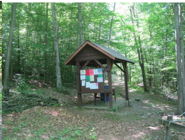
Washstand w/bulletin board