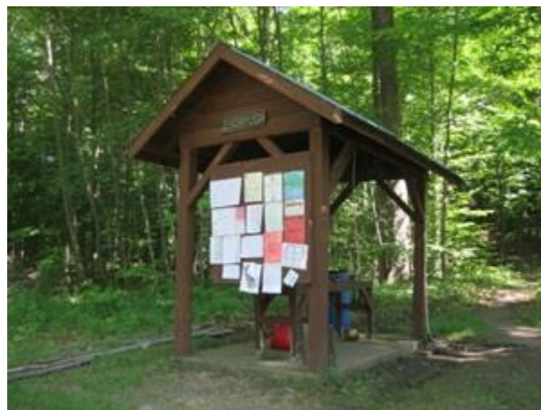
Washstand w/bulletin board

Cayuga is the largest campsite we have and includes a washstand and latrine. Normally the site is set-up to accommodate 36-40 campers, however that can be increased if necessary as this site has lots of room to move in additional platforms/tents. The site is set-up to camp two separate, smaller troops. It is divided (if necessary) into 2A and 2B. The ground cover is partially grassed which is kept mowed/trimmed. It is by far the most level/spacious which makes it the ideal site to set-up additional personal tents. It is the closest campsite to the Trading Post as well as the Handicraft and Waterfront Program areas. The site is in high demand at all times! It does border Abenaki and Susquenango sites. Susquenango has electric which can be utilized if the site is vacant for its users have given you permission.