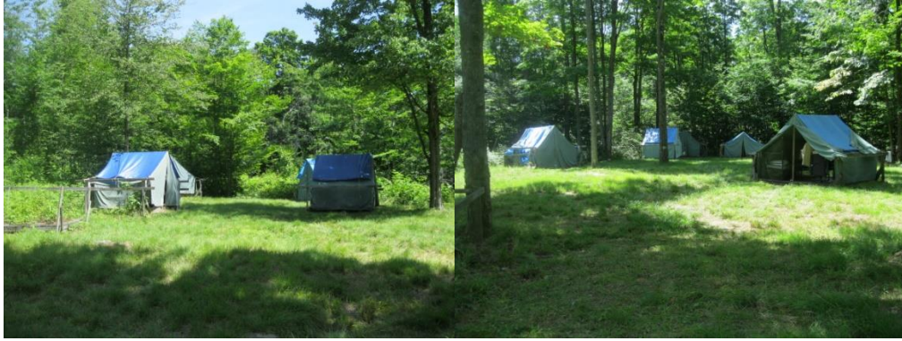
Campsite - looking north